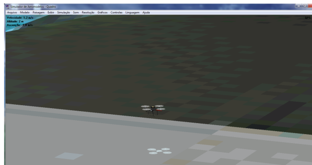
Figure 2. Take-off simulation screenshot, using FMS [Hama et al. 2011].

As preliminary results, we are able to simulate the model infrastructure using Flight Model Simulator 3 (FMS). FMS is an RC-Sim used to receive signals from radio transmitters and simulate them in a virtual UAV through a 3D graphic world. Currently, by encoding the generated streams in the same sequence created in transmitters we can simulate a set of operations 4 . In Figure 2, we show a take-off simulation screenshot using FMS. The image shows a quadrotor rising vertically.